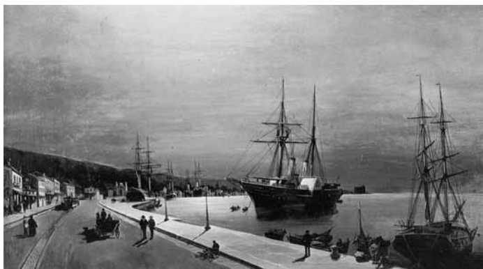
Volanakis Konstandinos, The Port of Volos , c. 1875

In the Greek painter's profile, edited here by Velissiotis, one finds a number of geographical correspondences with de Chirico's biography.